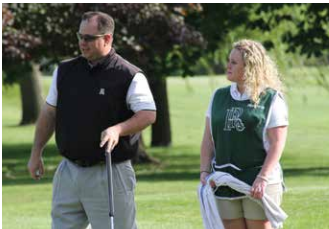
Caddie manager working with a caddie