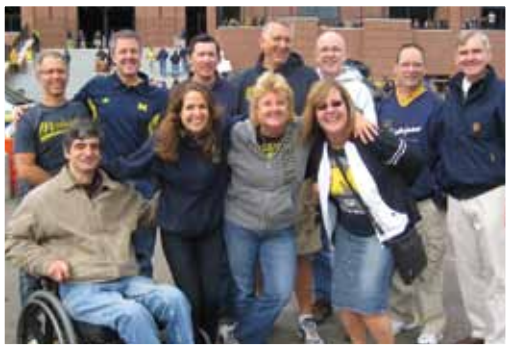
The Michigan New Scholar class of 1981 at an Alumni reunion on Sept. 17.