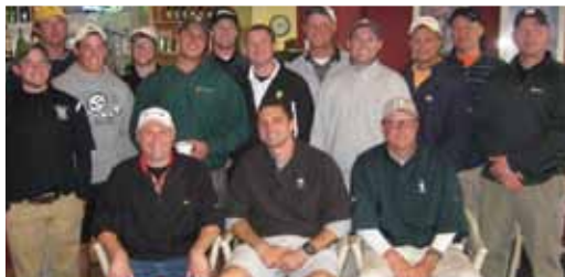
Evans Alumni at the NIU Golf Outing on Oct. 16 at Village Greens of Woodridge.

I did manage to return to Michigan State after many years, when much to my surprise, I was awarded the Red Cedar Circle Alumni award in chemical engineering and material science in 2008. Otherwise, life remains busy thanks to lots of golf, church activities, and various volunteer organizations.