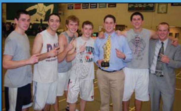
Miami Scholars win their fourth championship in five years at the 2010 Winter Outing basketball tournament.