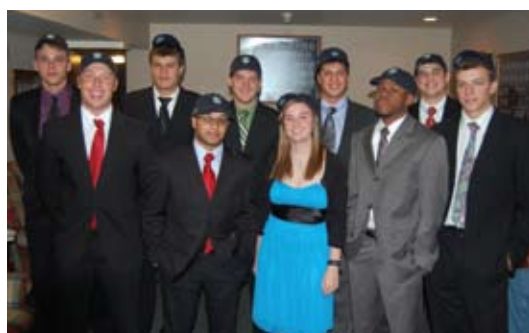
The Northern Illinois senior class in May.